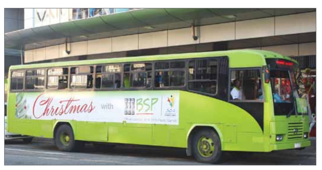
The BSP Christmas bus at the Suva Central Building loading bay before the Christmas Charity visitations to the Western and Central Division from December 16-19th, 2014.